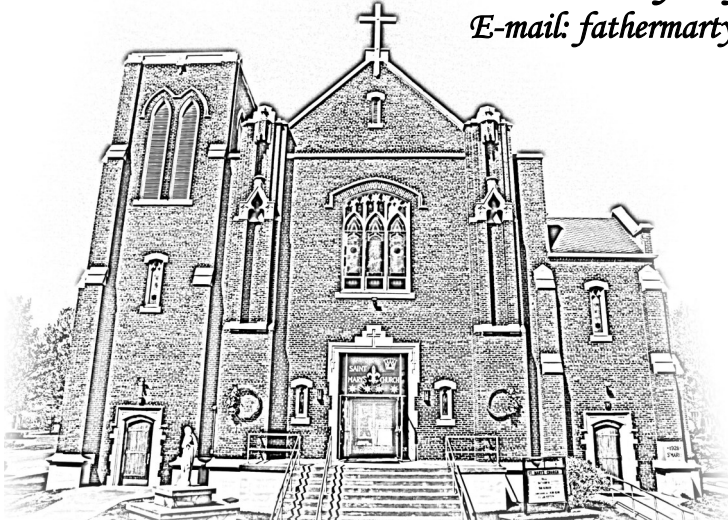
St. Mary Catholic Church 401 Main Street Norway, MI 49870